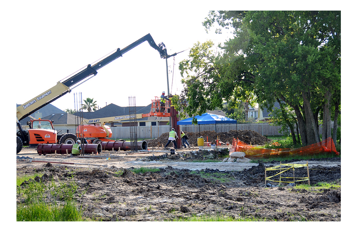
Leo A. Rizzuto Elementary School Covered Playground Area

Bayshore Elementary Covered Playground Area and Walking Track